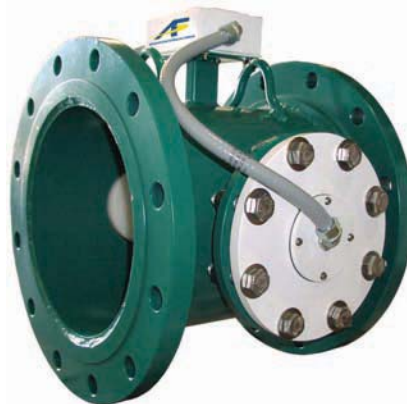
Figure 1. EMCO Flow Systems' Unimag magnetic flowmeter is an example of a pulsed AC measurement system.

DC magmeters were invented mainly as a solution to the zero-calibration issues associated with continuous AC magmeters. These magmeters operate based on a pulsed direct current. When the current is turned on, a voltage is generated, showing the velocity of the flowing liquid, plus any noise. When the current is turned off, any remaining voltage is assumed to be noise.